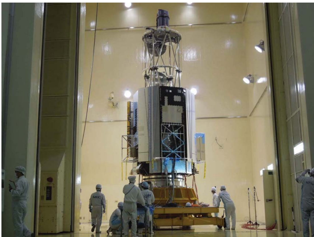
図 1: JAXA の音響試験設備に搬入される ASTRO-H 衛星。ロケットでの打ち上げ環境に耐えることを確認する試験の一コマ。ASTRO-H は日本の6代目の X 線観測衛星で、重さ 2.5 t、打ち上げ時の全長 8 m で、軌道上では 14 m に伸展する、日本で最大級の科学観測衛星である。最新の X 線検出器を複数搭載し、広い帯域を高感度で観測する力、X 線を精密に分光する力が、過去の衛星より桁違いに優れている。2015 年の打ち上げをめざし、JAXA を中心に東京大学はじめ国内の研究機関に加え、NASA、ESA などの世界の研究機関が協力して開発を進めている。(牧島・中澤研)

ASTRO-H satellite in mechanical test configuration moving into the acoustic test facility on May 2013. The cosmic X-ray satellite will be launched in 2015. (Makishima-Nakazawa group)